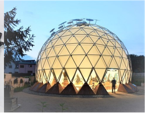
State Horticultural Show Apolda