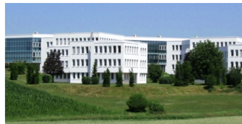
Head Office Würzburg