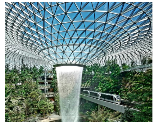
Jewel Changi Airport Singapore