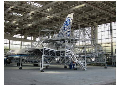
Combi Tail Dock Boeing B737